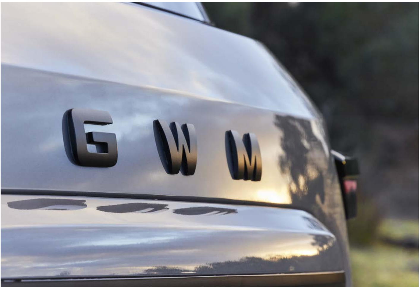
Black badging and decal