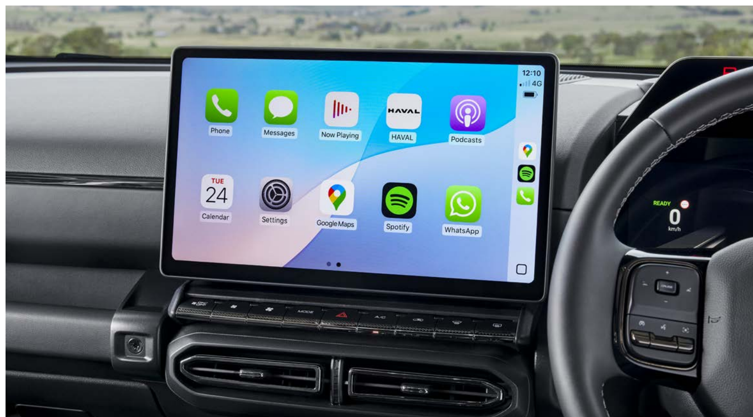
14.6" infotainment screen