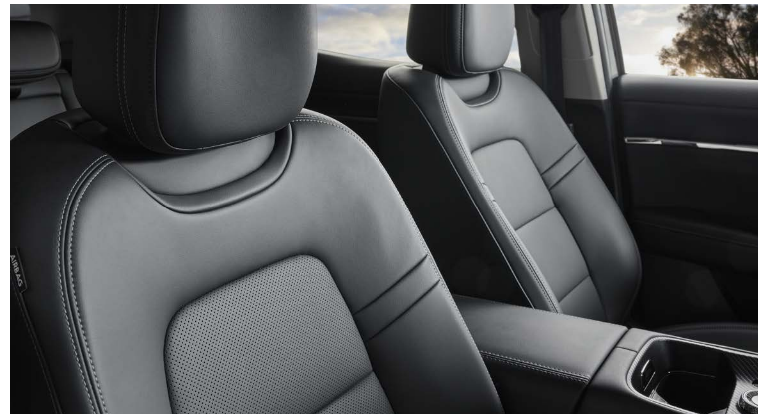
Leather accented seats