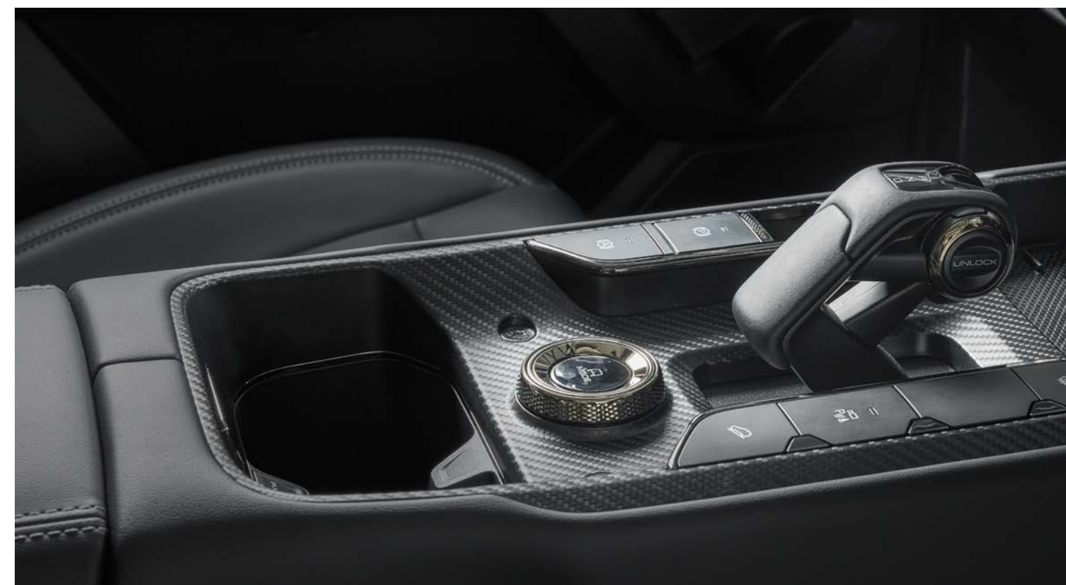
Expandable cup holder