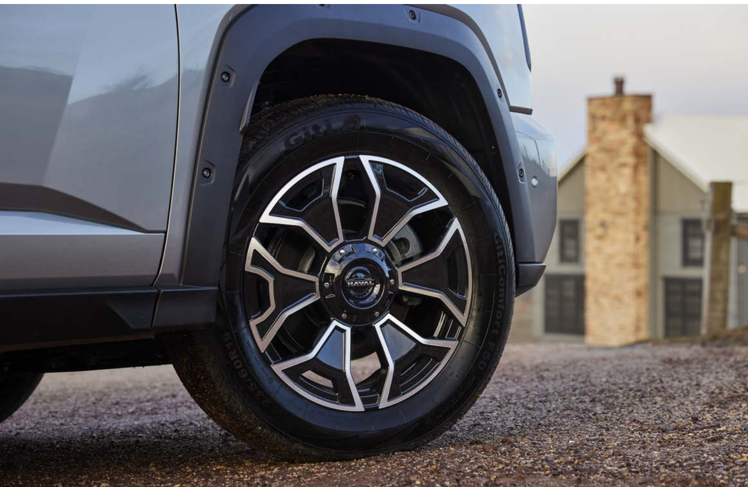
19" black alloy wheels