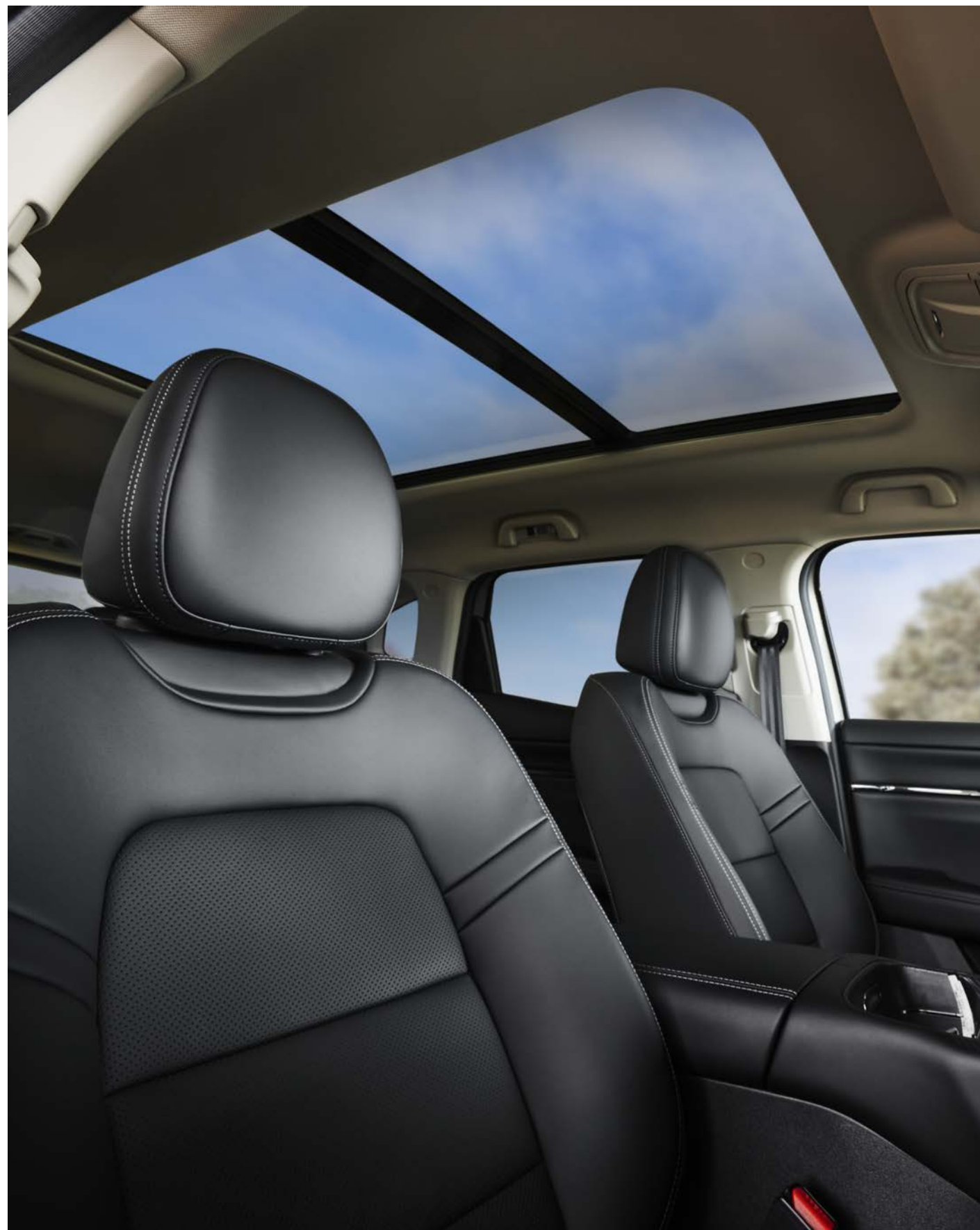
Panoramic sunroof with blind