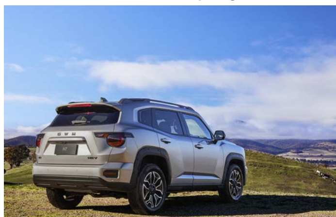
Sharp angular exterior

With striking, sharp body lines, the angular impact of the Haval H7 exterior hits hard in any setting. Fender flares add an extra edge to the silhouette, framing 19" black alloy wheels. On the inside, a sophisticated 14.6" infotainment screen plus panoramic sunroof and second row sunshades keep the family settled in style. While LED headlights and black details steal the show outside. It's a bold look that draws all the looks.