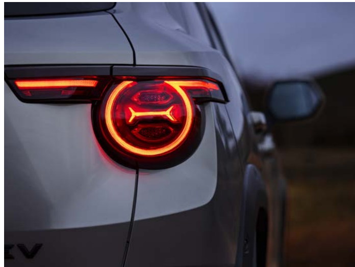
Unmistakable rear styling