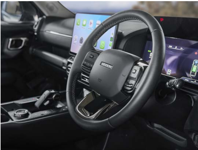
Intelligent instrument layout