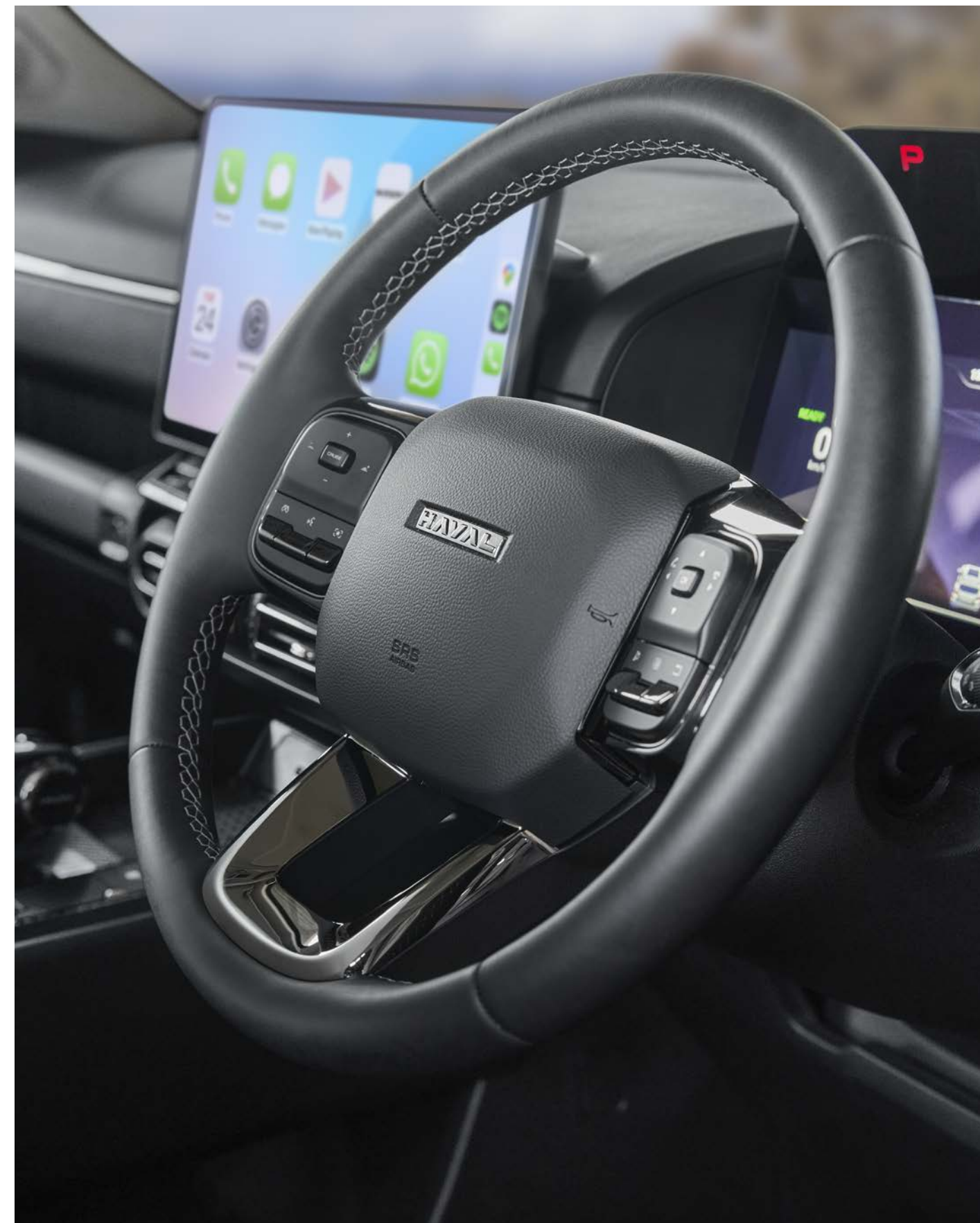
Multi function steering wheel