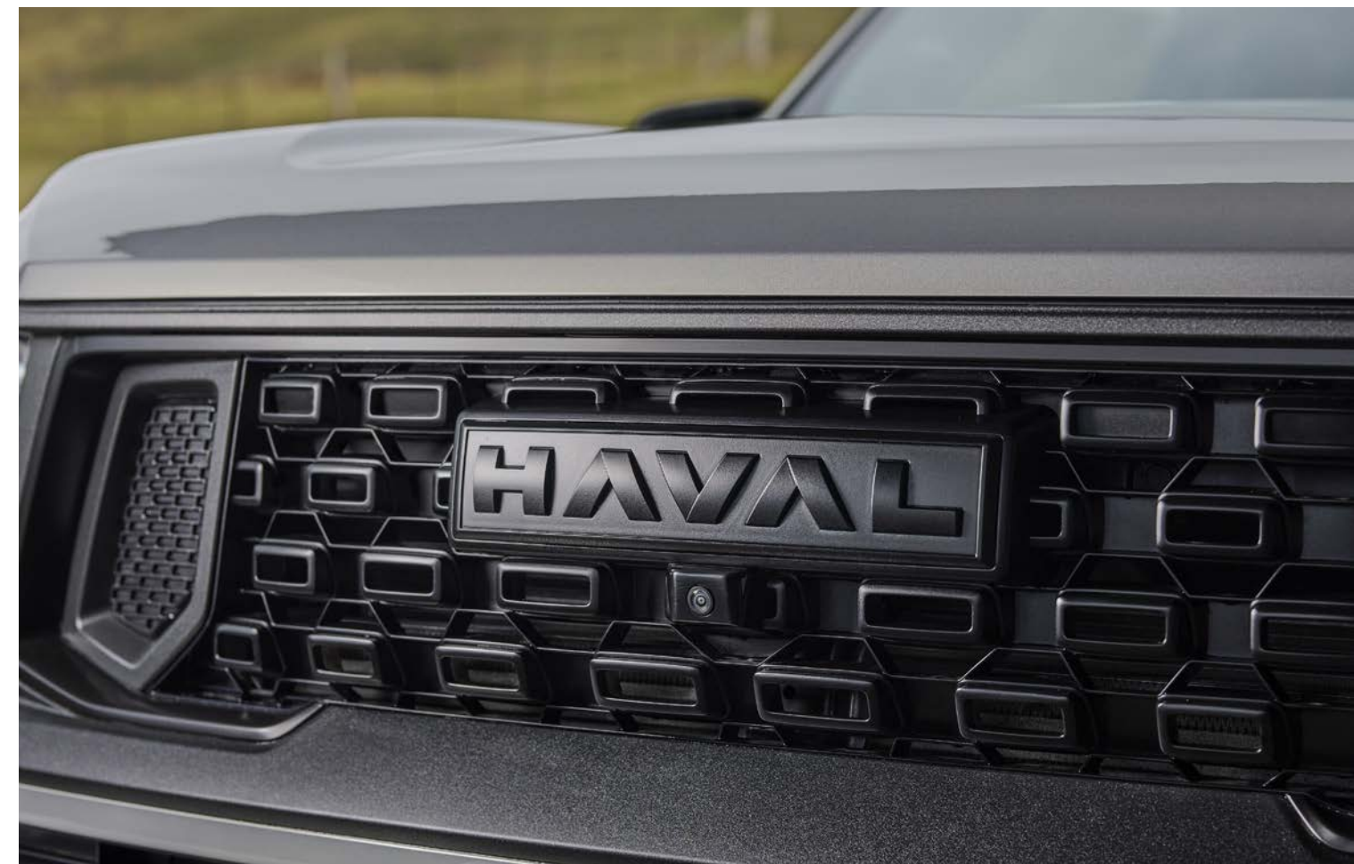
Blacked out front grille

With striking, sharp body lines, the angular impact of the Haval H7 exterior hits hard in any setting. Fender flares add an extra edge to the silhouette, framing 19" black alloy wheels. On the inside, a sophisticated 14.6" infotainment screen plus panoramic sunroof and second row sunshades keep the family settled in style. While LED headlights and black details steal the show outside. It's a bold look that draws all the looks.